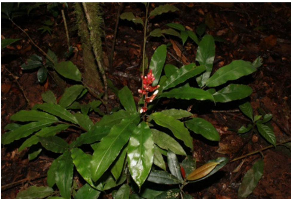
Figure 1. Alpinia hongiaoensis Tagane.

First, fresh leaves (300 g) and rhizomes (300 g) of A. hongiaoensis were washed and shredded. Then, essential oils from fresh leaves and rhizomes were obtained by hydro-distillation for 3.5h using a Clevenger-type apparatus, according to the Vietnamese Pharmacopoeia 6 . Each sample was extracted in triplicate. The resulting essential oils were dried with anhydrous Na 2 SO 4 , filtered, and kept in the dark at 4°C until analyzed.